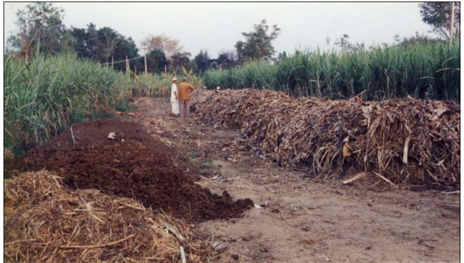
Top (Photo 3): Composting is done all over the Mysore farm. In this photo the compost piles are in between sections of sugarcane. The next crop of sugarcane will be planted where the compost piles are.

Balabhadra partook of the morning cow urine with Jayapataka Maharaja