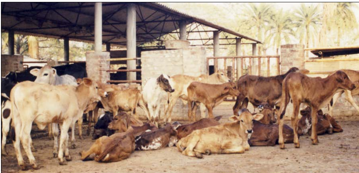
Left (Photo 4): a group of 3 to 6 month old calves in the Mayapur Goshalla.