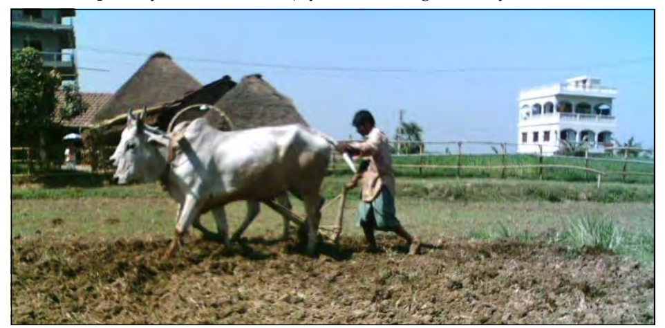
gurt drink made from protected cows) she made for us! And, also seeing the cows was a nice aspect.

To be in the fields in the goshalla with the cows, seeing the plowing was inspiring as it is said that one gram of practice is more valuable than a ton of theory. But also our (Continued on page 14)