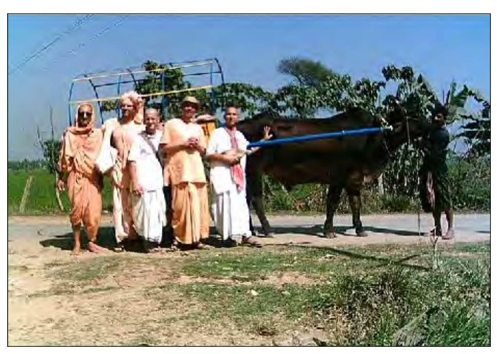
Above: Some members of ISCOWP's four day holistic cow care seminar Below: President of ISCOWP driving oxen at Bhaktivedanta Manor, England