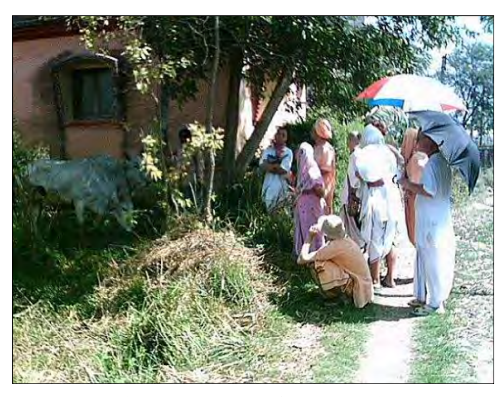
Seminar students with resting ox team after an ox power demonstration

eginning February 20, 2006, ISCOWP held a 5 day seminar entitled: Holistic Cow Care: Not Just Milk in Mayapur, India. This seminar was given in conjunction with the Mayapur Institute for Higher Education (MIHE). The slideshow (of the same name) recently developed by ISCOWP was one three hour class. Some of the students wrote their realizations about the seminar and cow protection in general. Here are some excerpts from the student's writings.