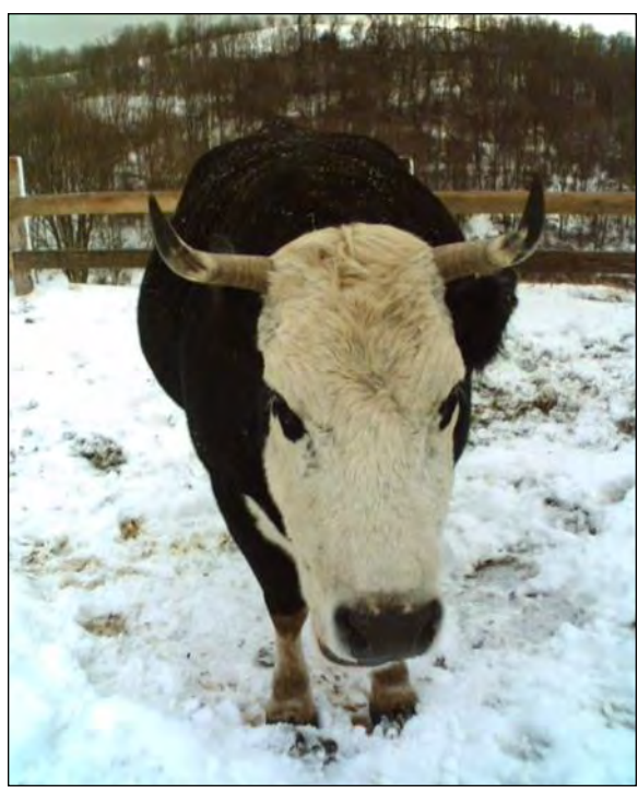
Vishaka has plenty of fresh air and space on the ISCOWP farm

crowded sheds, surrounded by their own fecal matter. High concentrations of ammonia in the air destroy the animals' lungs and weaken their immune systems. The result is that they are highly vulnerable to deadly